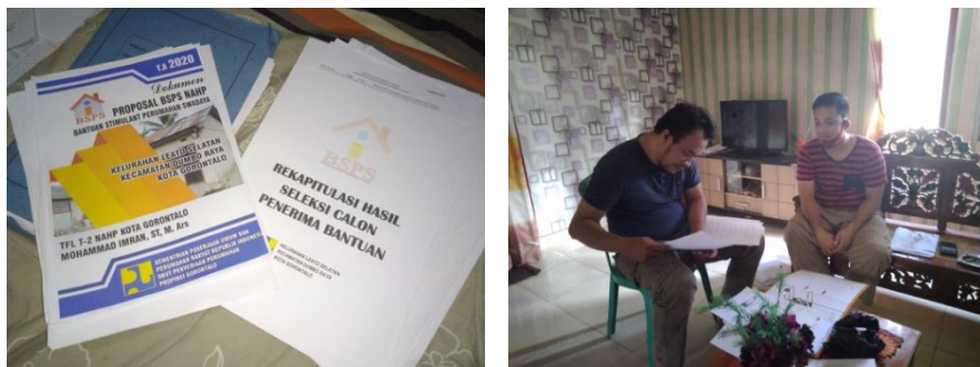
Figure 8. Preparation and Verification of Proposals