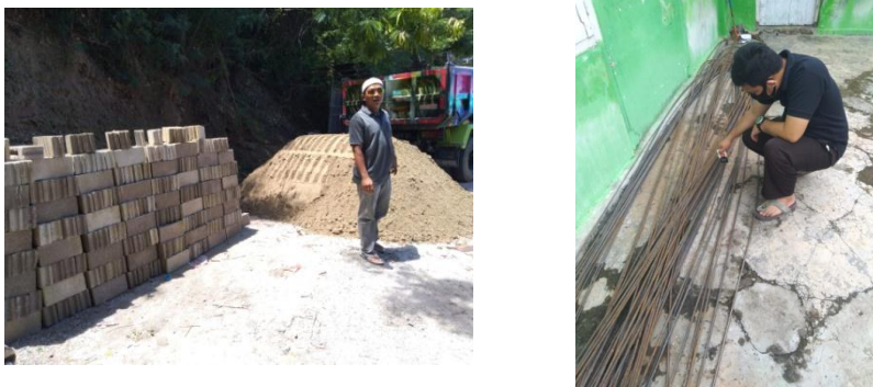
Figure 9. Material Distribution