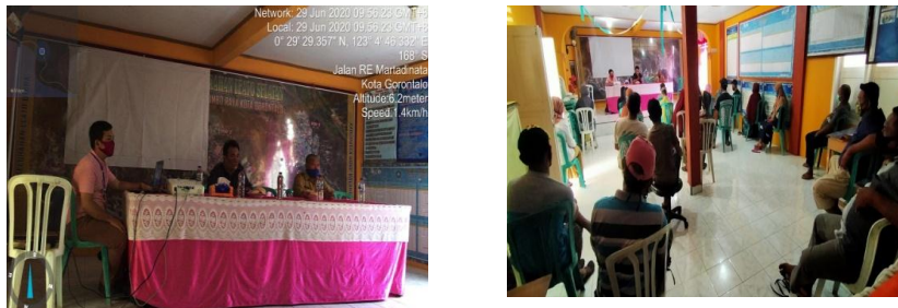
Figure 1. Outreach Activities in Leato Selatan Village