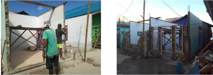
Figure 10. Implementation of Self-Help Home Rehabilitation