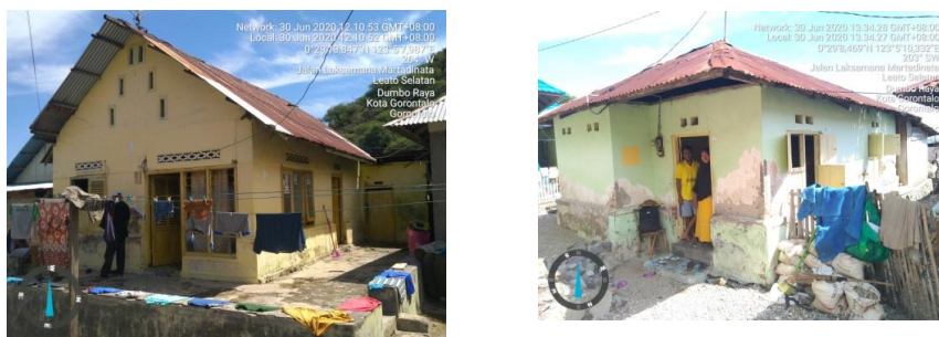
Figure 2. Example RTLH in the Activity Verification and Identification