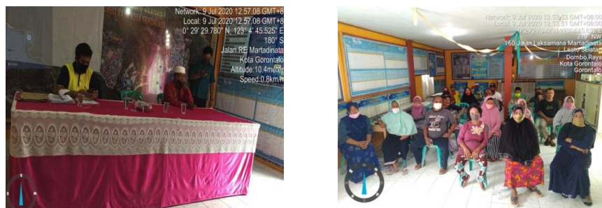
Figure 3. Community Consultation Activities Related to the Agreement on Verification and Identification Results