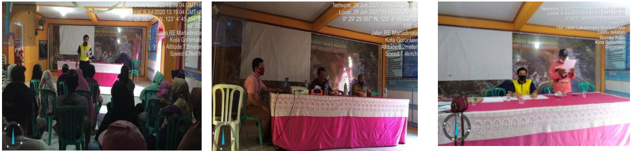
Figure 4. Community Consultation Activities Related to Formation of Assistance Recipient Groups