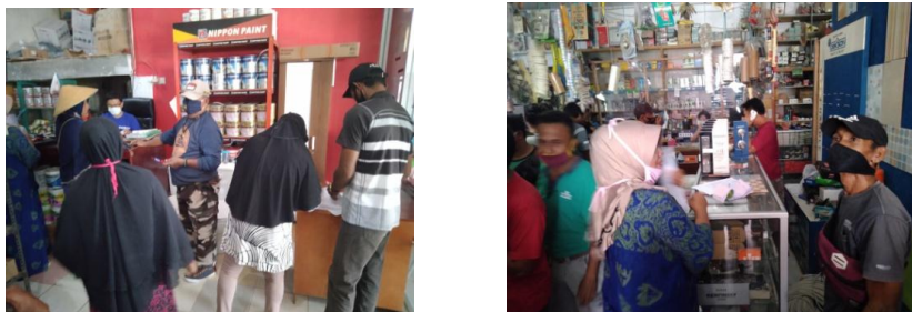
Figure 5. Store Survey conducted by Beneficiary (PB)