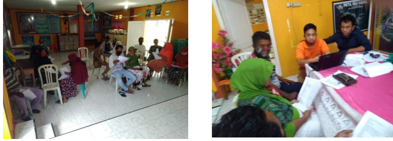
Figure 7. Community Consultation Activities Related to RAB Preparation