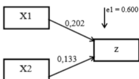
Figure 1. Structure Model Path Diagram 1 Model Path

R Square value of 0.00, meanwhile for the value of e1 can be searched by the formula e1 = 1 - 0.040 = 0.600 . Thus, the path diagram of the structure model 1 is obtained as follows.